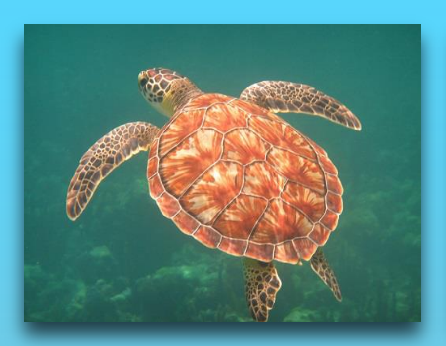
GREEN (CHELONIA MYDAS)