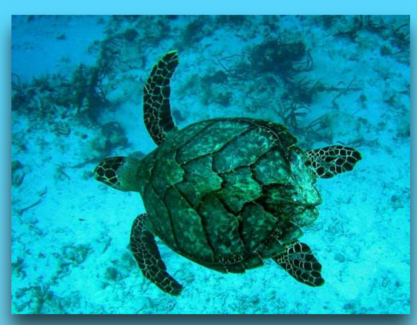
HAWKSBILL (ERETMOCHELYS IMBRICATA)