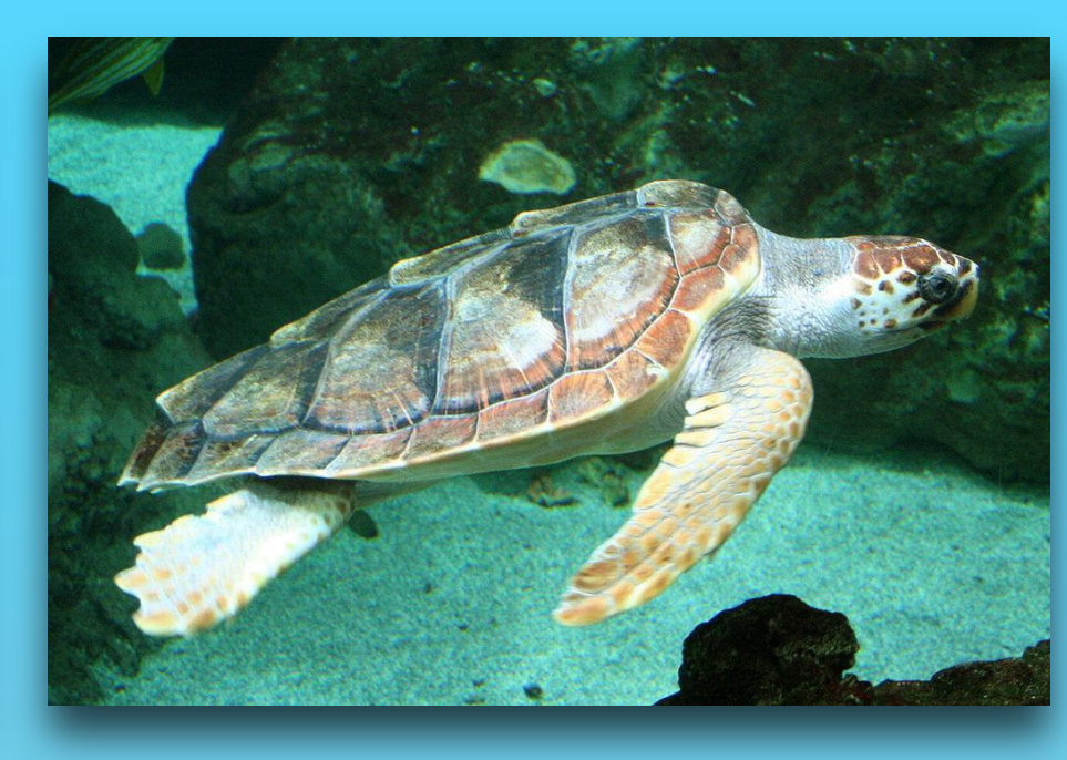
LOGGERHEAD (CARETTA CARETTA)