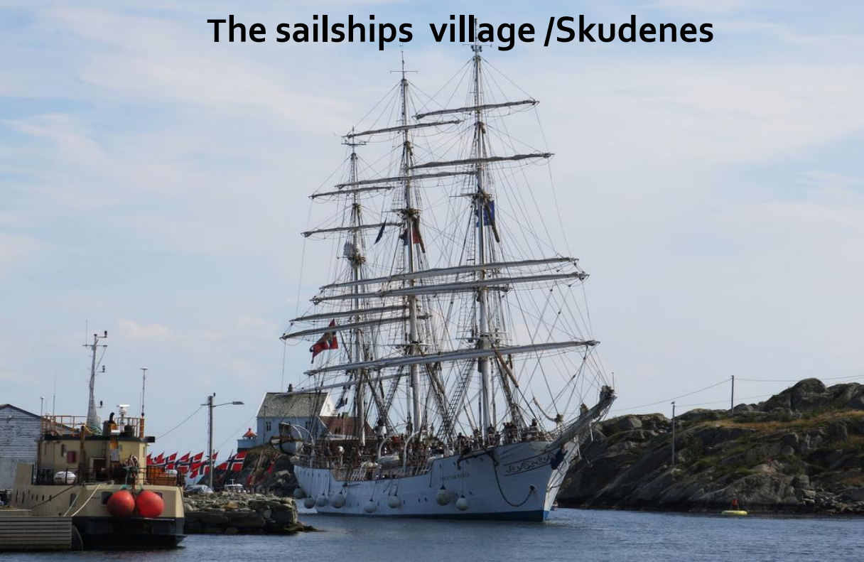
The sailships village /Skudenes