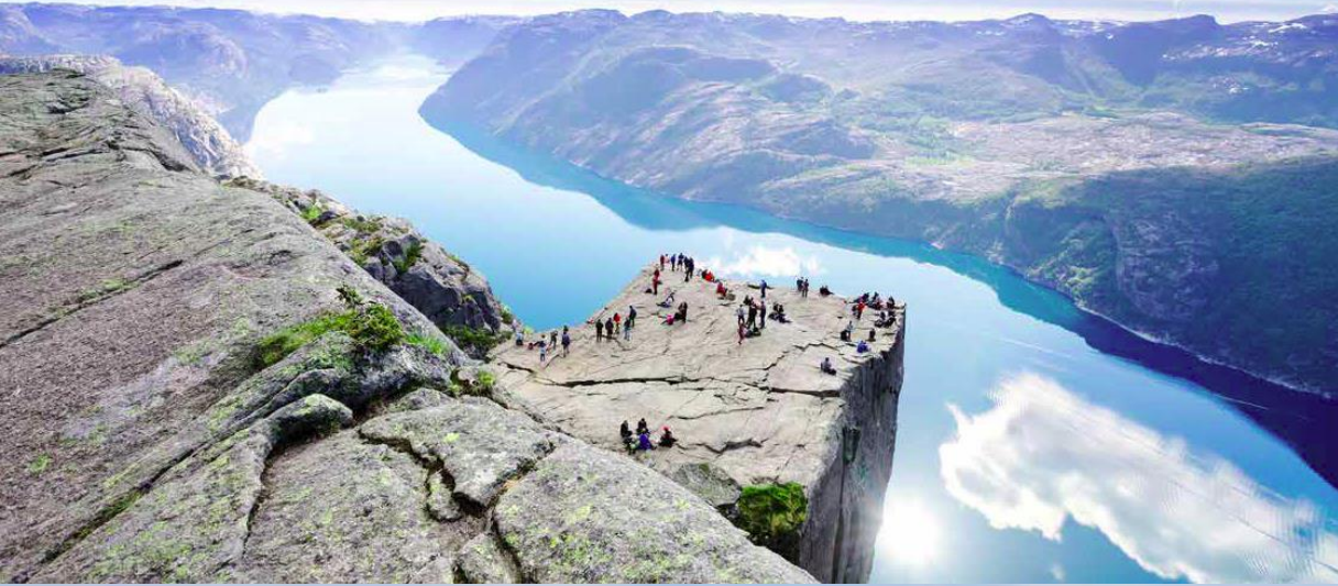
The Pulpit Rock /Jørpeland