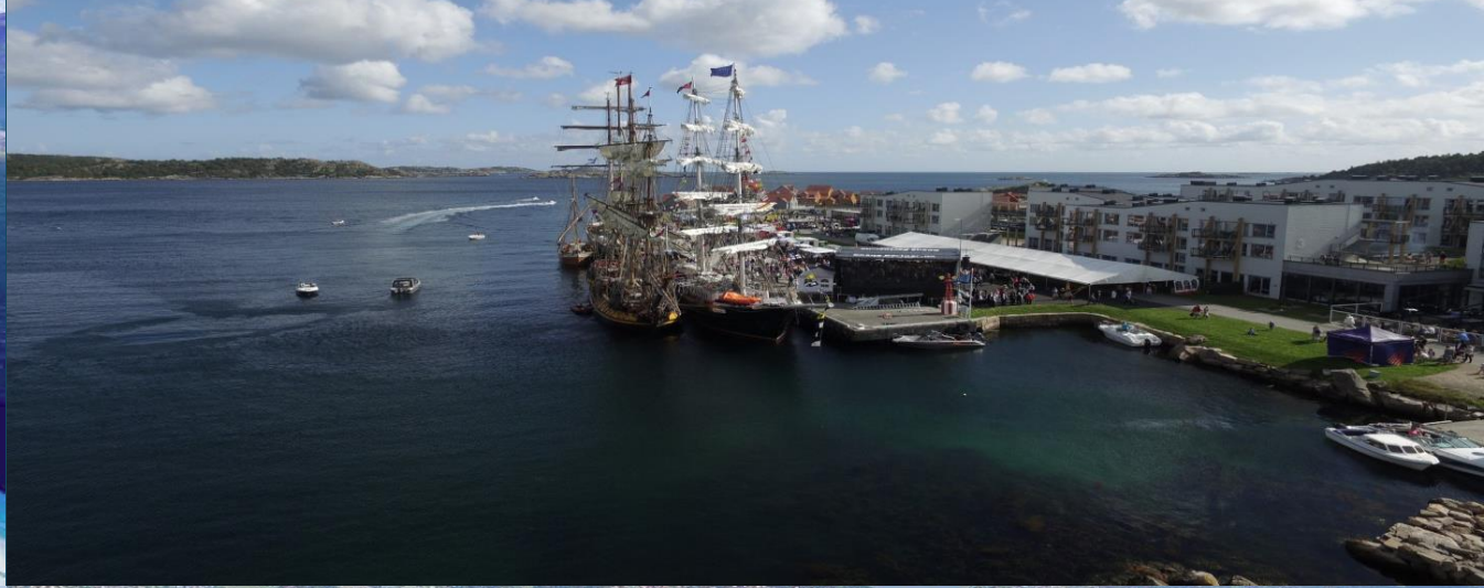
Southern point of Norway /Båli